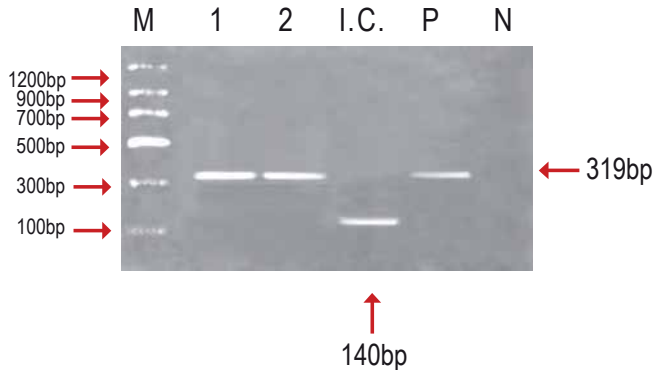
Fig. 1 Result:

Lane M: Brig™ Molecular Weight Marker (Bioingentech Ltd.) Lane 1~2: T.ovis Positive samples Lane I.C.: Internal control Lane P: Positive control Lane N: Negative control